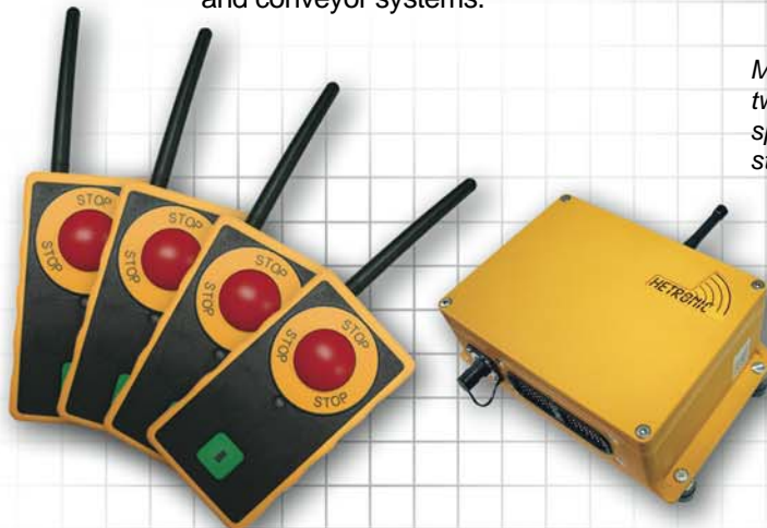
MINI V1 with corresponding receiver component