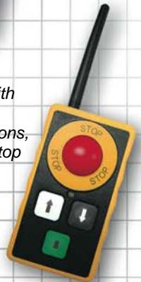
MINI V2 with two single-speed buttons, start and stop