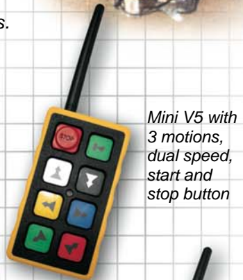
Mini V5 with 3 motions, dual speed, start and stop button

The MINI V1 transmitter is designed as an Emergency-Stop system. Up to four operators can shut down the machine or equipment simultaneously, providing maximum safety when required. The MINI remote Emergency-Stop system is typically used on direction drills and conveyor systems.