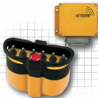
Standard Nova-S with matching receiver