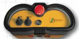
OEM version for mortar pump

The NOVA-S in combination with a Hetric's receiver assures effortless integration of the machine circuitry.