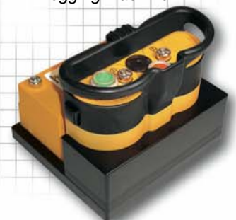
OEM version with docking station and battery charger