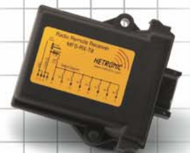
MFSHL RX-T8 Receiver