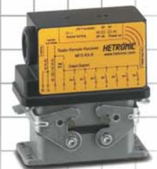
MFSHL RX-T8 Receiver