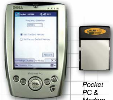
Pocket PC & Modem

The MFS feature enables up to 20 transmitters to be operated in close proximity while sharing the same frequency. Therefore, operators don't have to worry about frequency management.